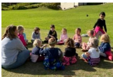
Sunny days at Bush Kinder