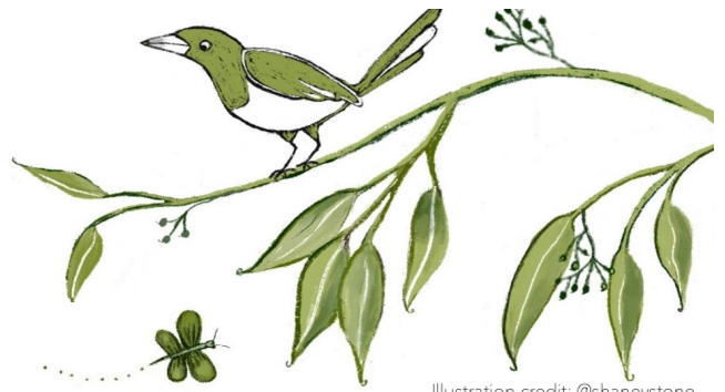
Illustration credit: @shaneystone