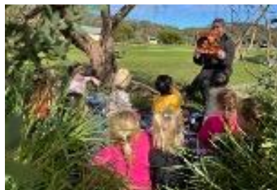
Storytime at Bush Kinder