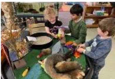
Caring for our environment

We are learning to/focus area: opening our hearts to different ways of being, becoming and belonging in our community.