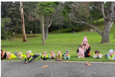
Kinder at the Park!