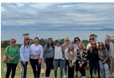
Our wonderful team!