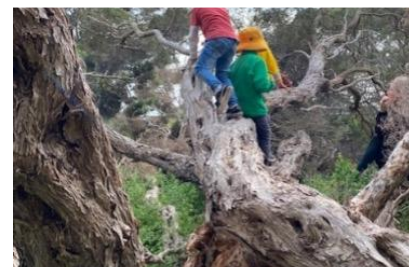
Lots of tree climbing!