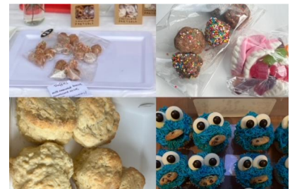
Some yummy treats!