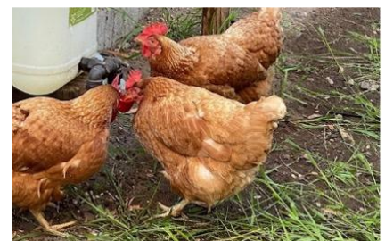
Our happy hens :)

theresilienceproject.com.au/early-years/