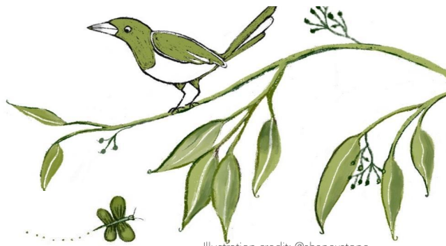
Illustration credit: @shaneystone