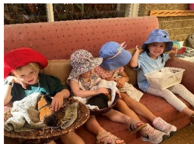
Taking care of our pets