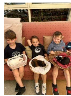
Patting the Kinder Pets