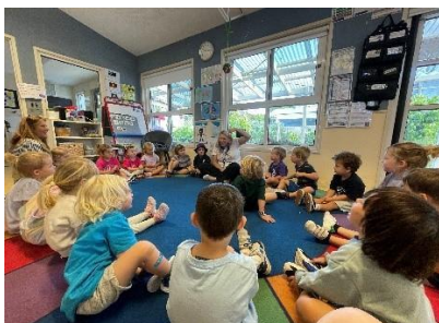
Purple Platypuses group time