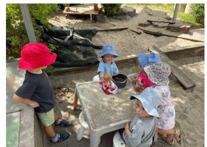
Playing with sand