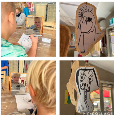
Drawing self portraits

Developing trusting relationships with teachers and peers and settling into our kinder program.