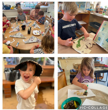
Creating pirate hats & maps