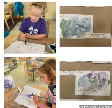
Our rainbow fish