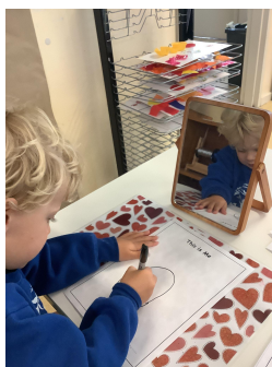
Drawing self portraits