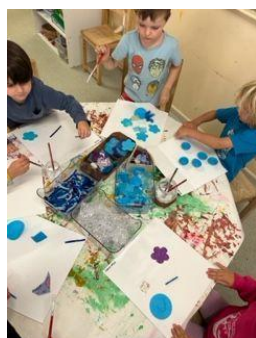
Art & Craft

We are learning to/focus area: Developing trusting relationships with teachers and peers and settling into our kinder program.